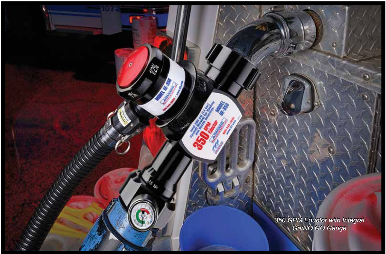
350 GPM Eductor with Integral Go/NO GO Gauge