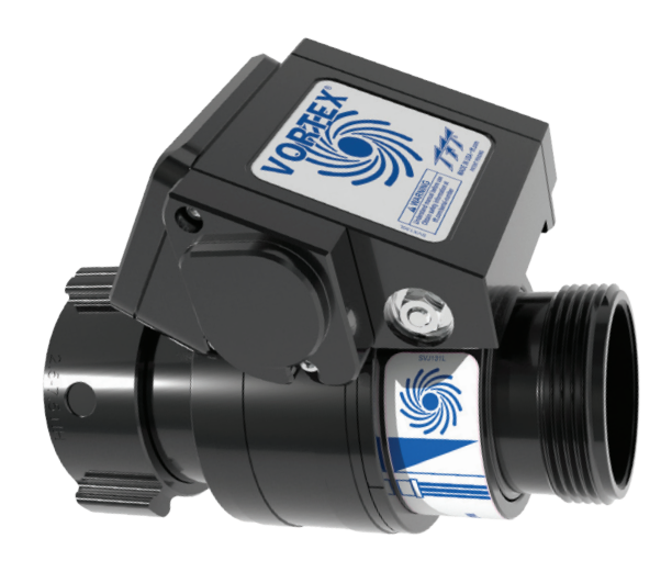
Available in a manual or electric remote (ER) version. Also available with a 3.5" (89mm) inlet coupling.

The 6" (152mm) VORTEX is ideal for industrial water and foam applications with a capacity of 8000 gpm (30,283 l/min). Six user controlled fins within the nozzle allow for either a straight stream or a long reaching dispersed pattern with no loss of waterflow volume.