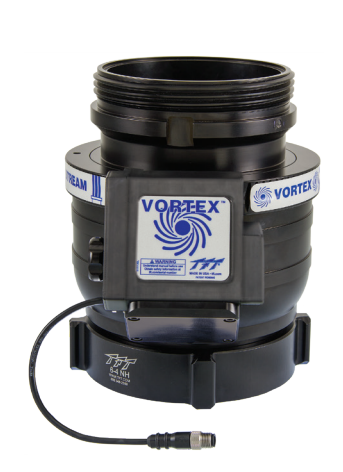
Available in a manual or electric remote (ER) version. Perfect for the TFT Tsunami monitor.

The VORTEX Master Stream series easily changes a smooth bore straight stream to a fully dispersed pattern by manually adjusting a handle or using a button on one of TFT's remote controller's. This allows operation with a manual or remote control apparatus monitor.